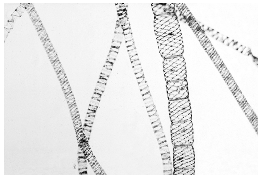
Magnification \times 200

(a) (i) Put a cross in the box next to the term that describes the process involved in the cell divisions in a filamentous alga. (1)